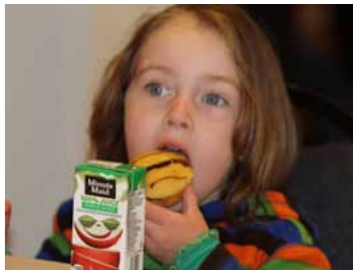
Photos courtesy of Allyson Williams and a bunch of great kids and teachers!